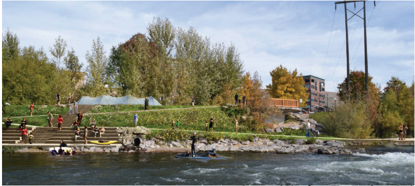
Proposed Riverfront Terrace, Caras Park

Next Phase of Improvements Planned With the completion of phase I, plans are already underway for the next phase of park improvements. The implementation team will focus energy on the underbridge play space. Through a partnership with the City of Missoula, a $1.2 million grant from the U.S. Economic Development Administration has been awarded to complete the river access near Brennan's Wave.