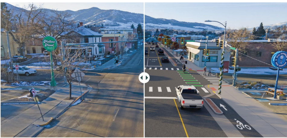
Preferred Higgins Corridor Alternate

The public input process identified Concept B, 3 lanes with raised bike lanes, as the preferred alternative. This concept would extend the existing design on Higgins north of Broadway south to Brooks Street. Learn more about this project at <u>https://www.engagemissoula.com/</u><u>higgins-avenue-corridor-plan</u>.