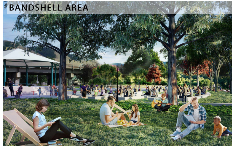
Rendering of the Bandshell Area in Caras Park

With an opportunity to save a construction season and nearly $100,000 in additional costs, the Foundation and Missoula Parks & Rec generated the revenue needed to rebuild and flatten the green hill into useful space, rebuild and expand the amphitheater