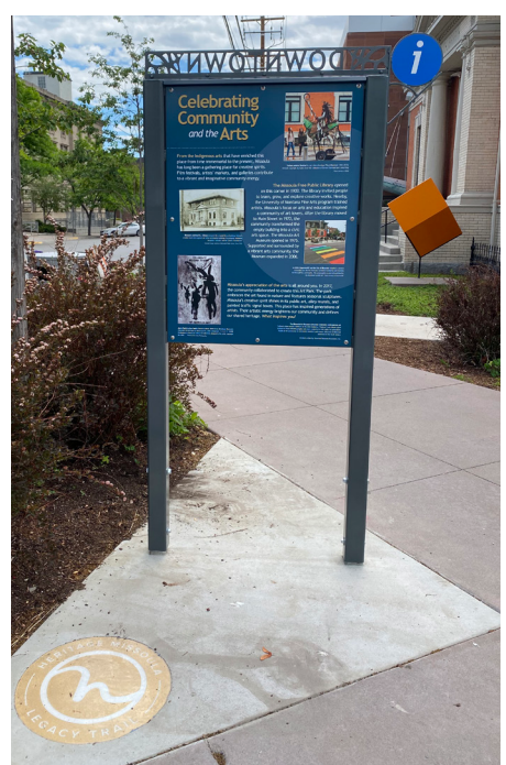
Wayfinding and Interpretive Kiosk

owntown Missoula, from time immemorial to present, has been a gathering place for people of all walks of life. It is a place where transportation routes converge, where people gather to express themselves, and where they gather for community. To showcase and preserve Missoula's spirit of place through the Heritage Missoula program, the Downtown Missoula Partnership (DMP), along with partners Historical