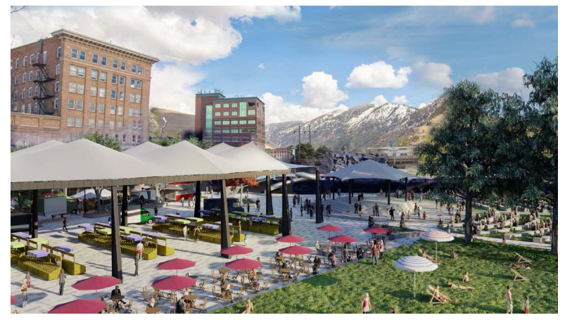
Rendering of the Pavilion & Multi-Use Lawn Area in Caras Park

Construction is now underway, and the improvements should be completed by May 2022. This project is just