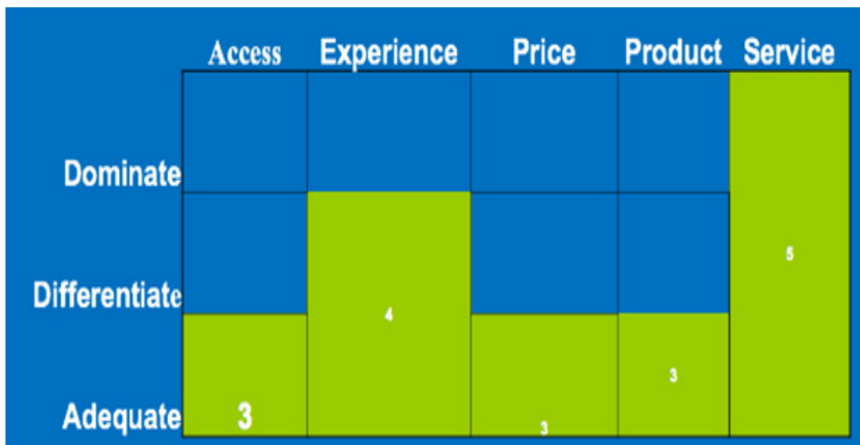
(President continues on p. 5)

In summary, The Myth of Excellence says you can only "win" in one of these five areas. If you want to be a good business, pick one category you can dominate in, pick one area to differentiate in and pick three other areas to be on average with others in your industry. Below is a chart with an example of what this may look like.