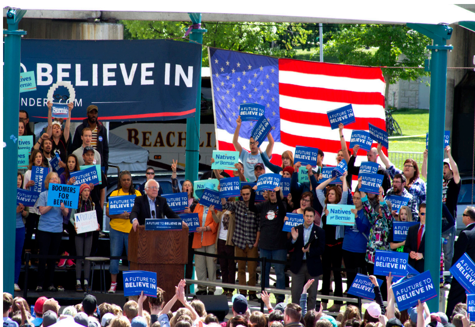
Sen. Bernie Sanders holds a rally in Caras Park on May 11 to an enormous and enthusiastic crowd. Citizens from around Montana made the trip to Missoula to see the Presidential Candidate speak.

Drawing close to 80,000 attendees over the course of the 13-week schedule, Out to Lunch and Downtown ToNight are funded entirely by Missoula-area businesses or organizations that purchase sponsorships, as well as vending fees. Nearly 70 businesses and organizations are supporting the programs this year.