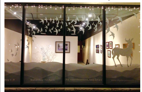
e3 Convergency Gallery, Voted Most Elegant Window Display