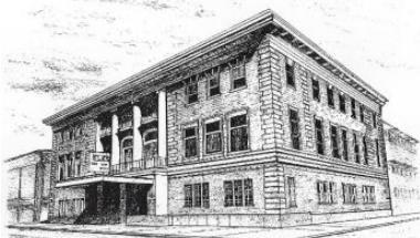
Historic Photo of the Hellgate Elks Lodge